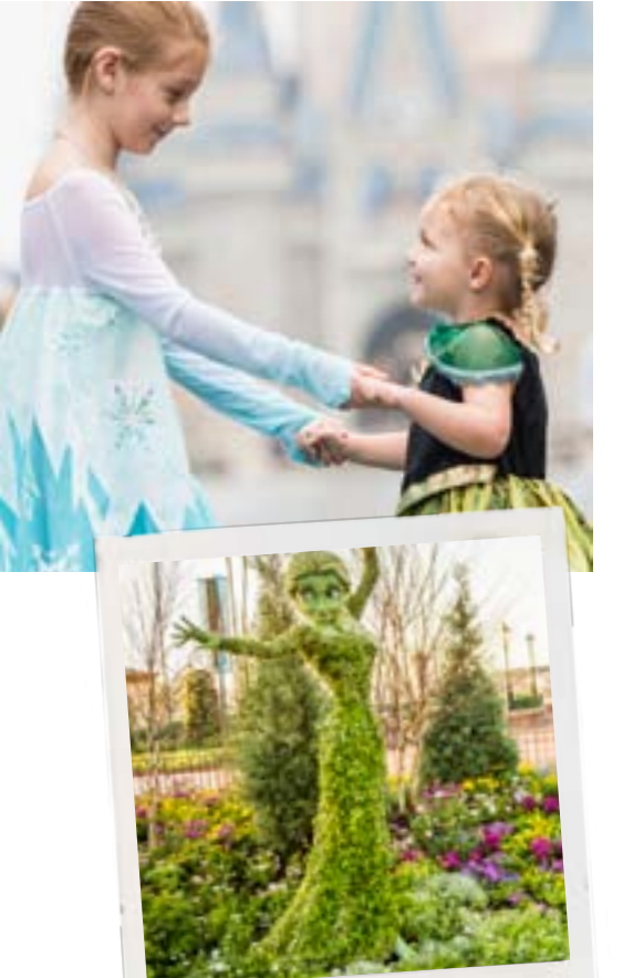
Let it go - you're on holiday